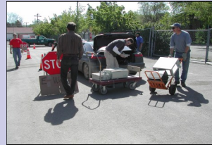
Computer equipment being collected for recycling at the 2004 Electronic Waste Collection Event.

Demanufacturing: Manually breaking down computer equipment into its separate components. The components are then either recovered for resale/reuse in other equipment or sorted for future recycling or recovering of raw materials.