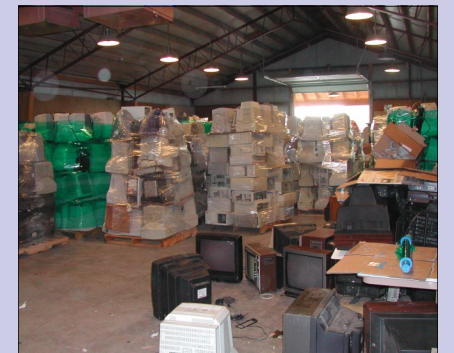
Palletized computers ready for transport and recycling during the 2006 E-Waste Recycling Collection Event.

Keep your personal information private. Use disk cleaning software to remove personal information from your computer prior to donation (cookies, internet browser's cache, email contacts and documents, recycle and trash folders, nontransferable software, etc.).