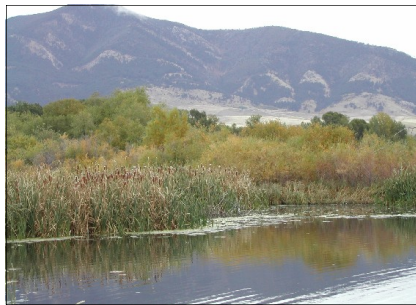
Marsh wetland near the East Gallatin River north of Bozeman