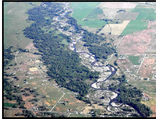
The West Gallatin River with associated riparian area and floodplain north of Four Corners, Gallatin County, Montana.

The future stewardship of our surface and ground water is dependent on the Community as a whole...that responsibility begins with each individual.